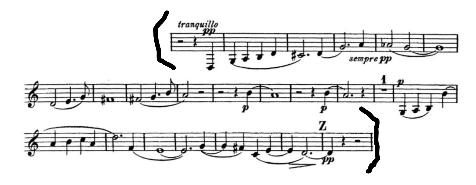
RESPIGHI Pines Of Rome Offstage Solo